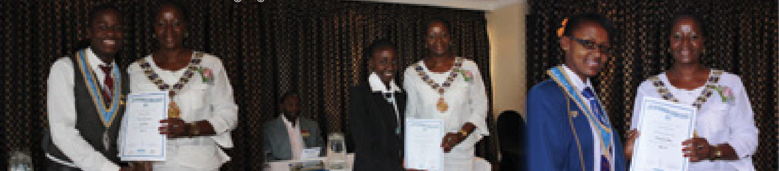
The outgoing councillors were awarded with certificates of achievements.

The event was entertained with some electrifying performance by Greenwell - Matongo Community Library Dancers.